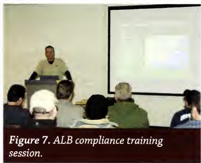
Figure 7. ALB compliance training session.

For answers to questions about regulated materials and permits in Massachusetts, please call the ALB program toll-free at 1-866-702-9938.